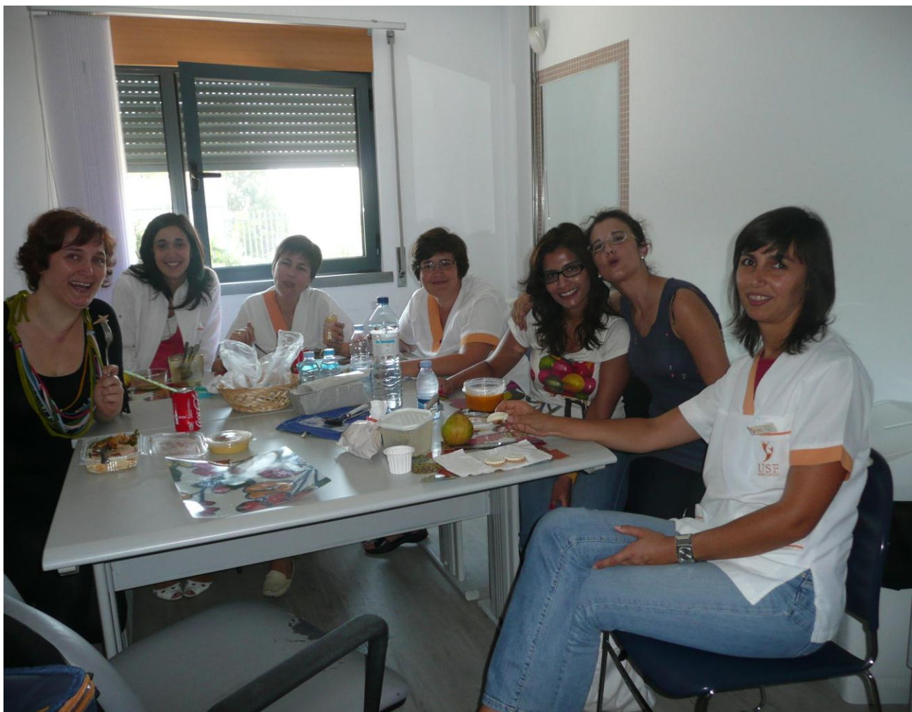
Above: The Doctors