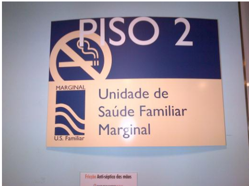
Figure 2. USF Marginal in Estoril